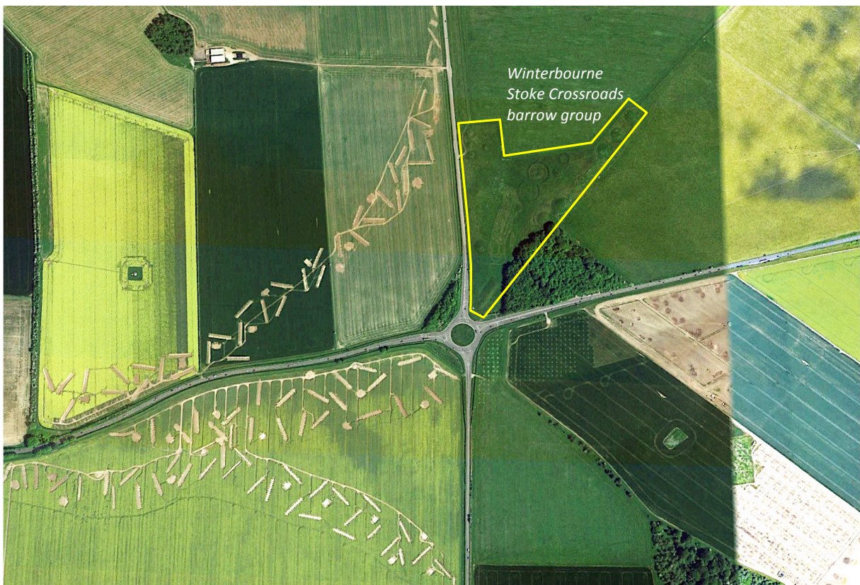
Figure 3: Winterbourne Stoke Crossroads (A303/A360 junction); archaeological evaluation trenches (in the course of excavation, 2018) in the areas of the proposed A303 scheme road and junction construction to the west of the WHS boundary.