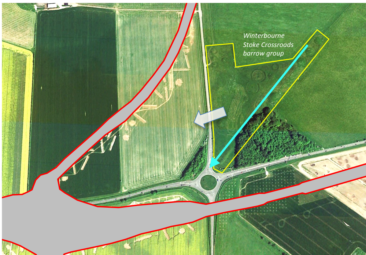
Figure 4: The landscape setting of the Winterbourne Stoke Crossroads round barrow group, showing the proposed new A303/A360 junction and road corridors (in grey), and the visual orientation of the linear barrow array (blue arrow) and general westerly/south-westerly vista defined by the terrain (white arrow).