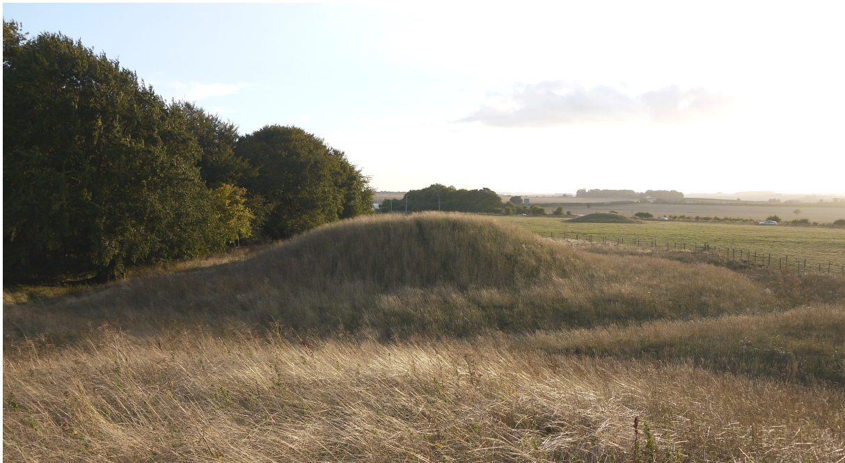
Figure 5: View from Winterbourne Stoke G5 on the alignment of the linear barrow array, oriented southwest towards Winterbourne Stoke barrow G4 (a bell barrow) and the Early Neolithic long barrow in the middle distance. The current line of the A303 can be seen immediately beyond this.